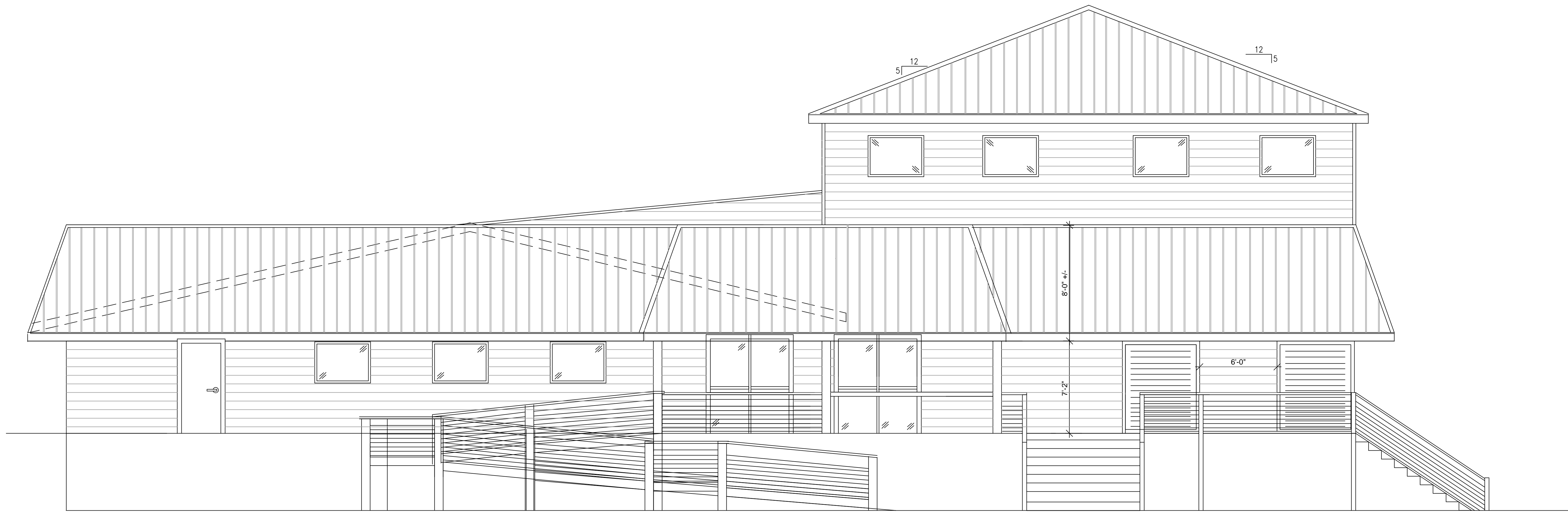
A FRONT ELEVATION SCALE: 1/8" = 1'-0"